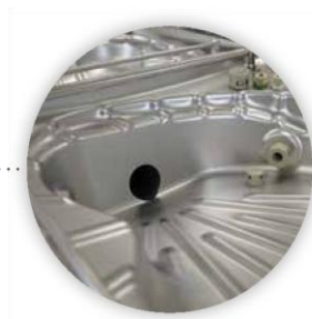
Stainless steel basins